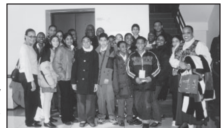
The Legacy lives on in the Diaspora. Caribbean students from Richard R. Green Middle School Bronx, New York Schomburg Conference February 2002